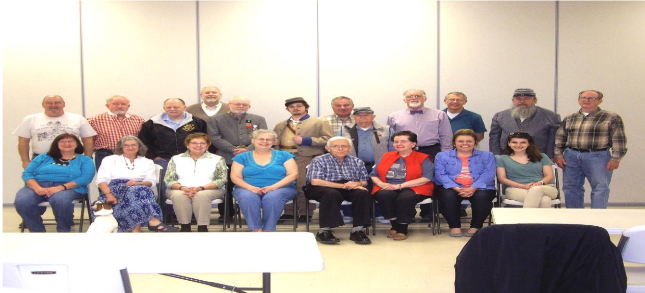
GROUP PHOTO